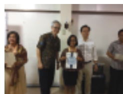
Certificate awarded after completion of CPI course