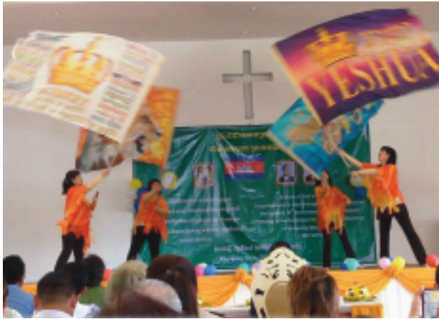
Dancers from Singapore welcoming Yeshua, the King of Kings!