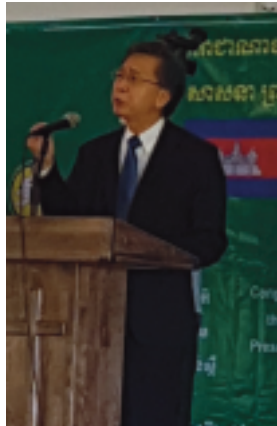
ICMS President delivering his address