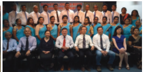
Group picture with the CPI graduates