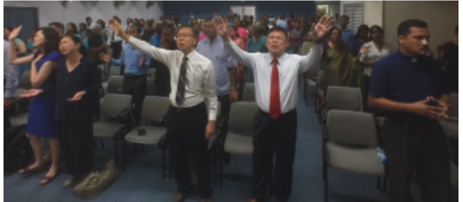
Deep in worship

There were some pastors who had sad but nonetheless victorious life stories. I will share a couple of these heart-breaking life experiences,