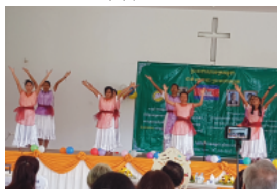
Dance item from the students