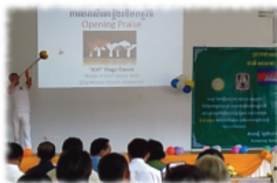
Team member sounding the trumpet