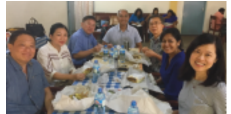
Team enjoying lunch at the training centre