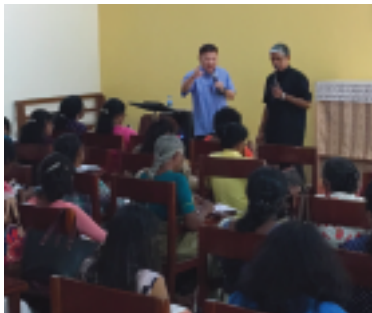
Teaching sessions in progress