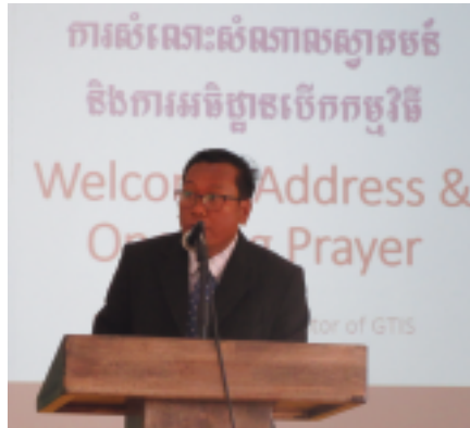
Our Partner giving his address