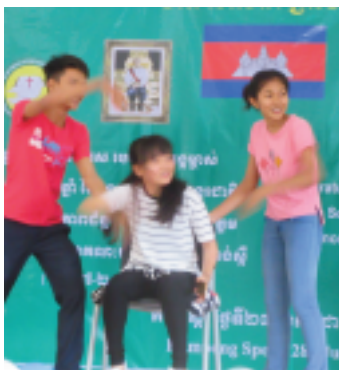
Skit by Grade 11 students