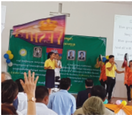
Two of our students leading worship