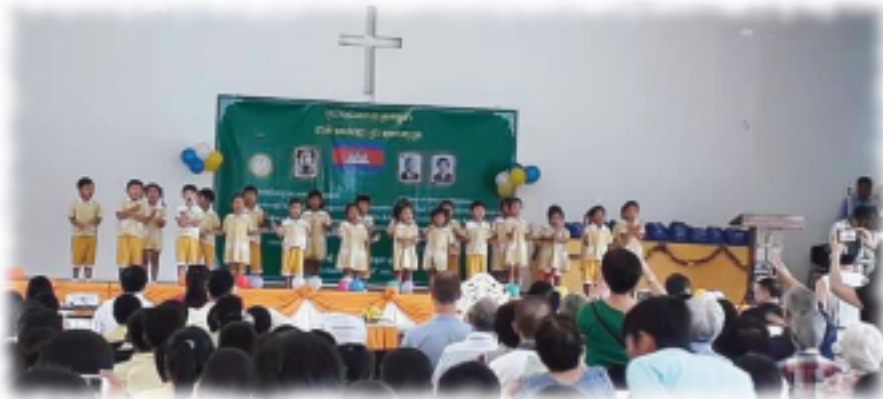
Our kindergarten kids performing a song item

We give thanks to our Mission Partners, Glad Tidings Church, for providing the resources to run the school, and Sembawang Presbyterian Church, for operating the Edelweiss Kindergarten.