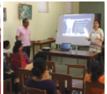
Photos (anti-clockwise from top left) of teaching and ministry sessions.