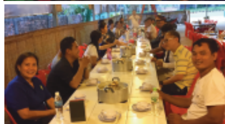
Bonding over dinner