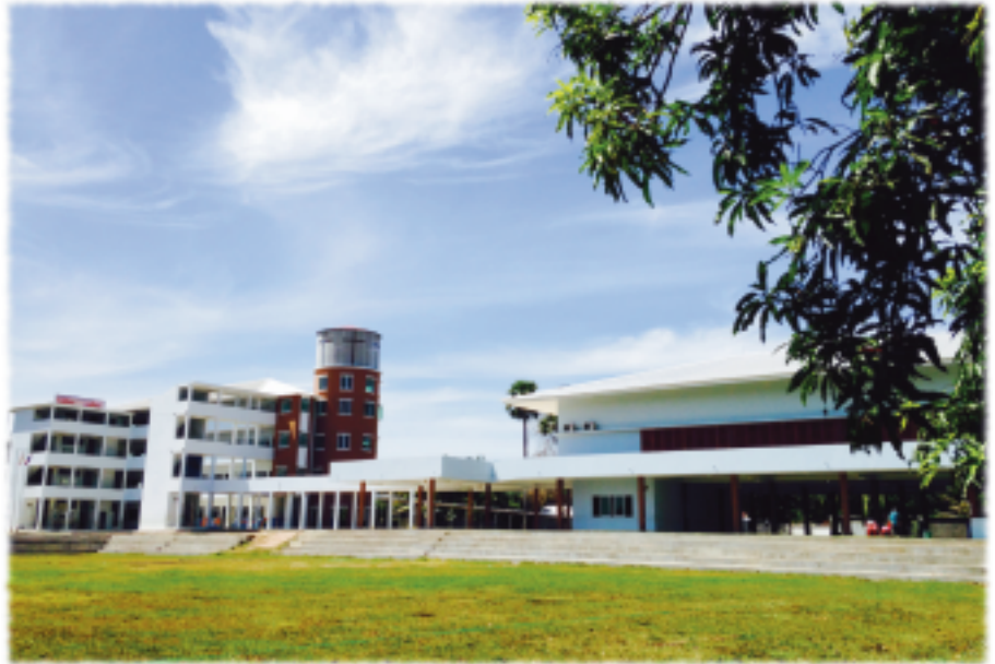
Glad Tidings International School building complex