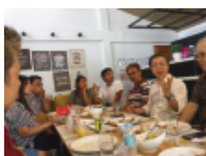
Meeting over lunch with our partners