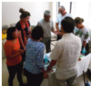
The team praying for the churches and people of Panabo

All praises and glory to our Lord whom we serve!