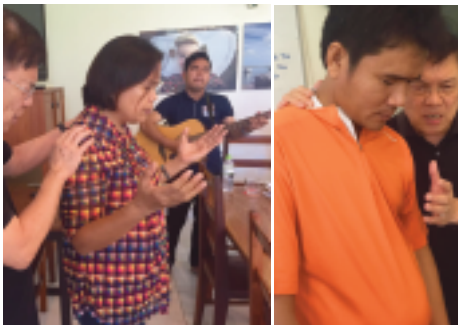
Praying a blessing over the Principal (left) and the Vice Principal.