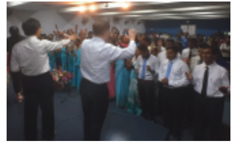
Prayer of blessing over the CPI graduates

ICM Singapore Bank : DBS Account No.: 033-017373-3