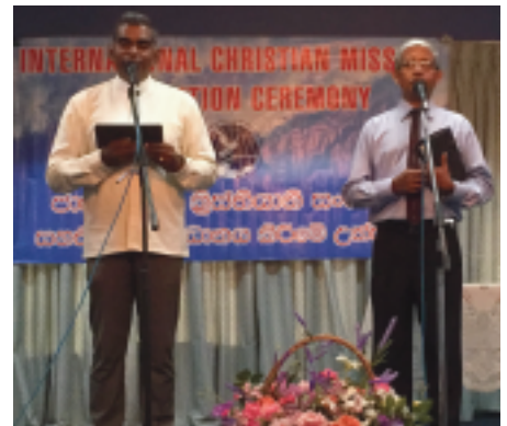
Our guest speaker (left)