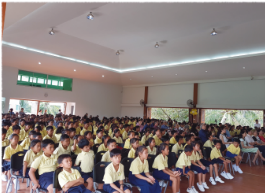
Grade 4-11 students

We have indeed come a long way even though 10 years might seem a short time to some. The Glad Tidings International School or GTIS, as the school is fondly called, is a project God laid upon our hearts to