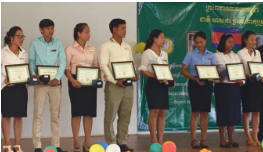
Awards to our long-service staff