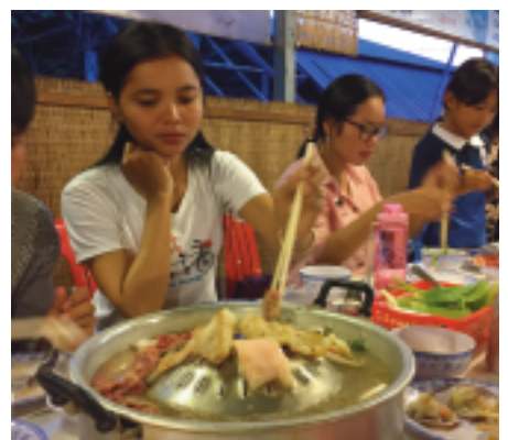
Sumptuous fare at dinner

“Let us not become weary in doing good, for at the proper time we will reap a harvest if we do not give up.”