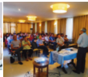
Participants at the Pastors' Conference