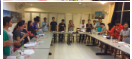
The teachers in worship.