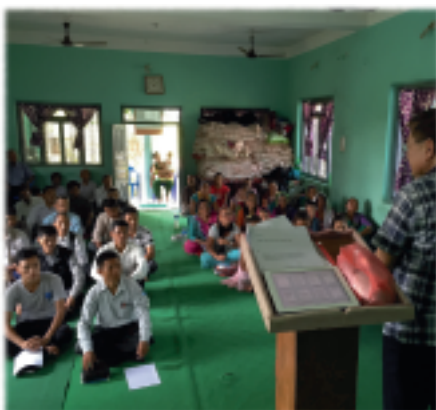
Church-planters attending ATP

NOTE: We welcome your gifts and participation in our Nepal mission. We are in need of $3,000 to buy a motorbike and $2,000 for fuel costs. Please write 'Nepal' behind your cheques.