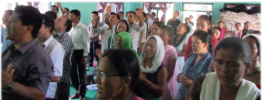
Village church planters worshipping and praying to God