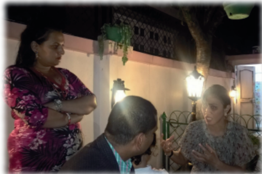
Sharing the gospel to the seller of shawls